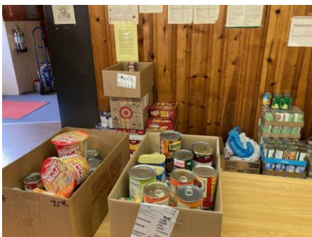
Lots of soup delivered Nov. 29