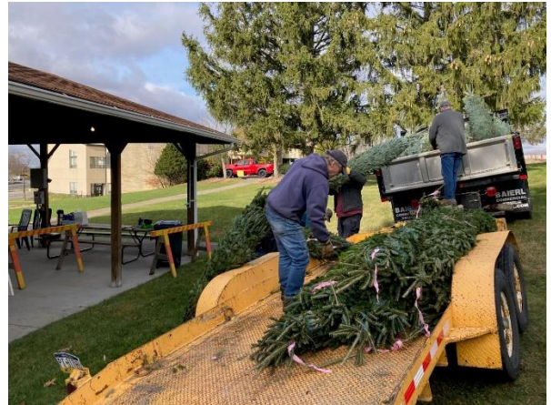
Lions unloading the dump truck and trailer.