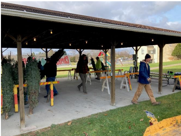
Lots of Lions at work setting up the tree sale.